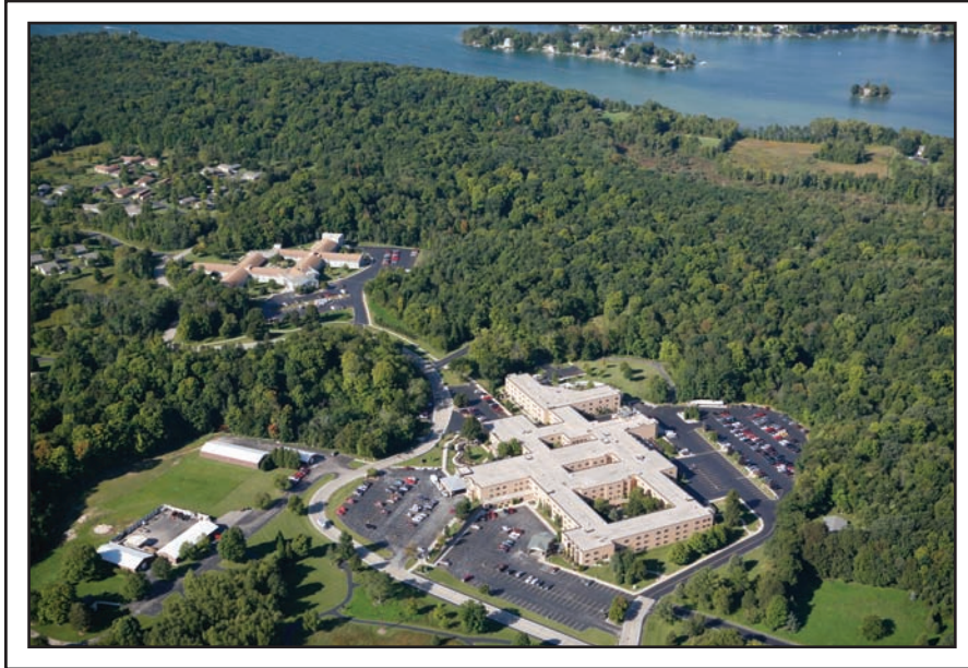
245 acres above Big Cedar Lake in the Town of West Bend

5595 County Road Z West Bend, WI 53095 262.306.2100